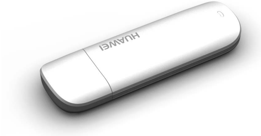
Figure 1-1 E173 profile

Figure 1-1 shows the profile of the E173.