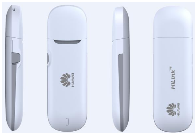
Figure 1-1 HiLink E3131 profile

Figure 1-1 shows the profile of the HiLink E3131.