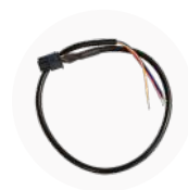
0.35 m 4pin Automotive adapter cable