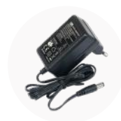
24V 0.8 A power adapter