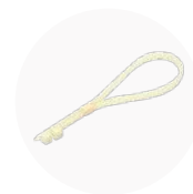
2x plastic straps