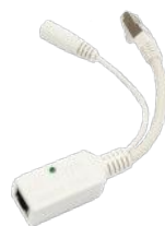
Gigabit PoE injector