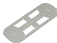
Ceiling mount base