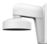
DS-1273ZJ-130 Wall Mount