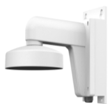
DS-1273ZJ-130B Wall Mount