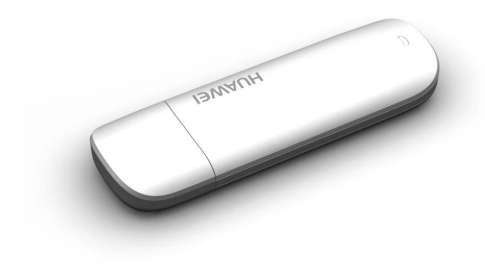
Figure 1-1 E173 profile